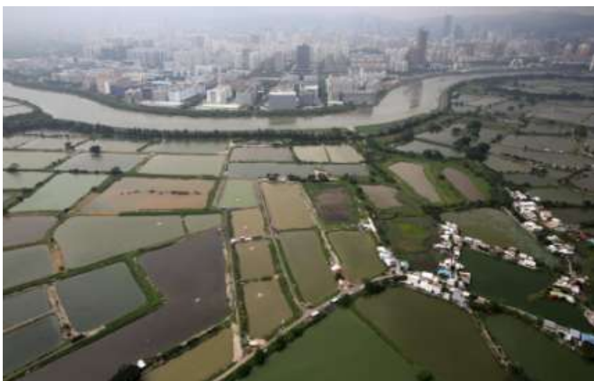
Shenzhen versus farmland

What is a small farm? The area of land it occupies is not the only significant parameter. Twenty hectares may be very big in India but very small in Argentina. Access to irrigation, the fertility of the soil, the type of production being undertaken, climate and topography are all factors in determining what is considered a small farm and what is not. There is clearly no universal definition of a small farm, and GRAIN had no possibility of adopting one. Building or proposing an all-encompassing definition was impossible because in many cases it would have rendered the available data inapplicable or impossible to interpret.