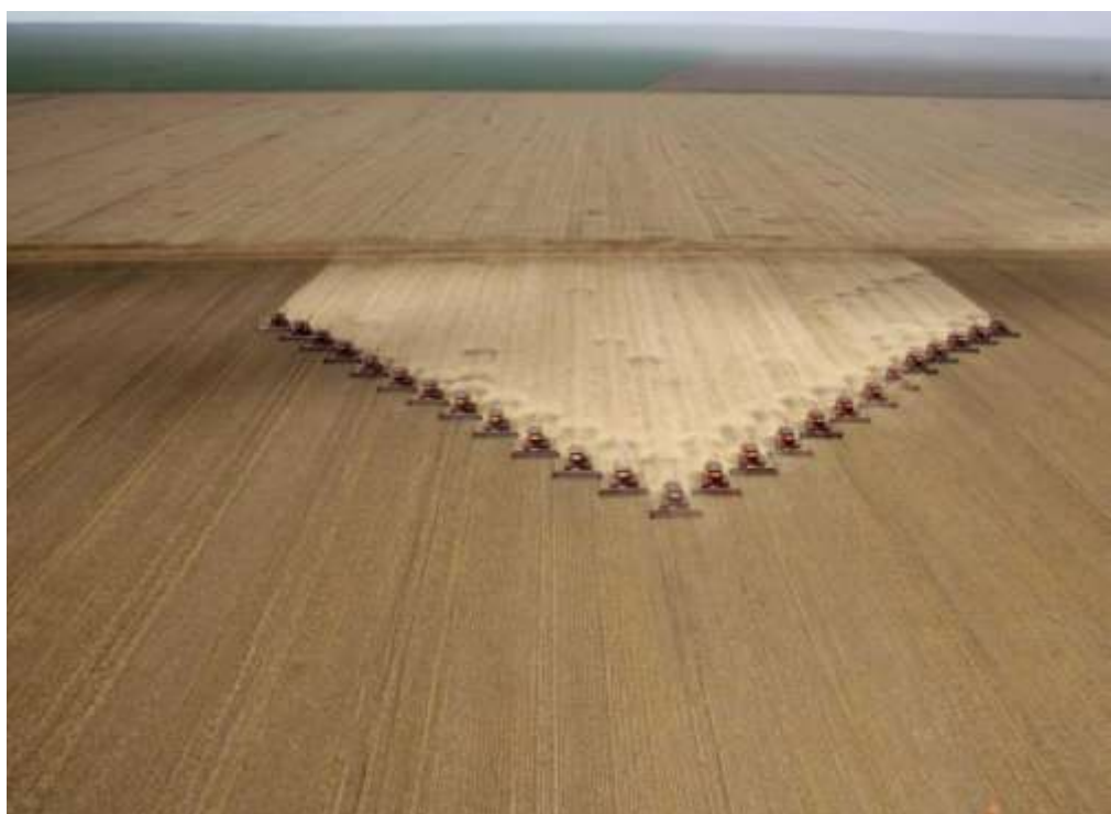
The primary concern for big corporate farms like this soybean plantation is their return on investment, which is maximised at low levels of spending and thus often implies less intensive use of the land

In a recent paper on small farmers and agroecology, the UN Special Rapporteur on the Right to Food concludes that global food production could be doubled within a decade if the right policies towards small farmers and traditional farming were implemented. Reviewing the currently available scientific