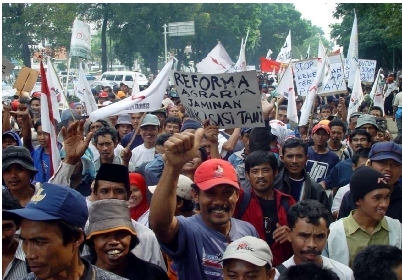
Land rights protest in Indonesia

The other shock was learn that, today, small farms have less than a quarter of the world's agricultural land – or less than a fifth if one excludes China and India from the calculation. Such farms are getting smaller all the time, and if this trend persists they might not be able to continue to feed the world.