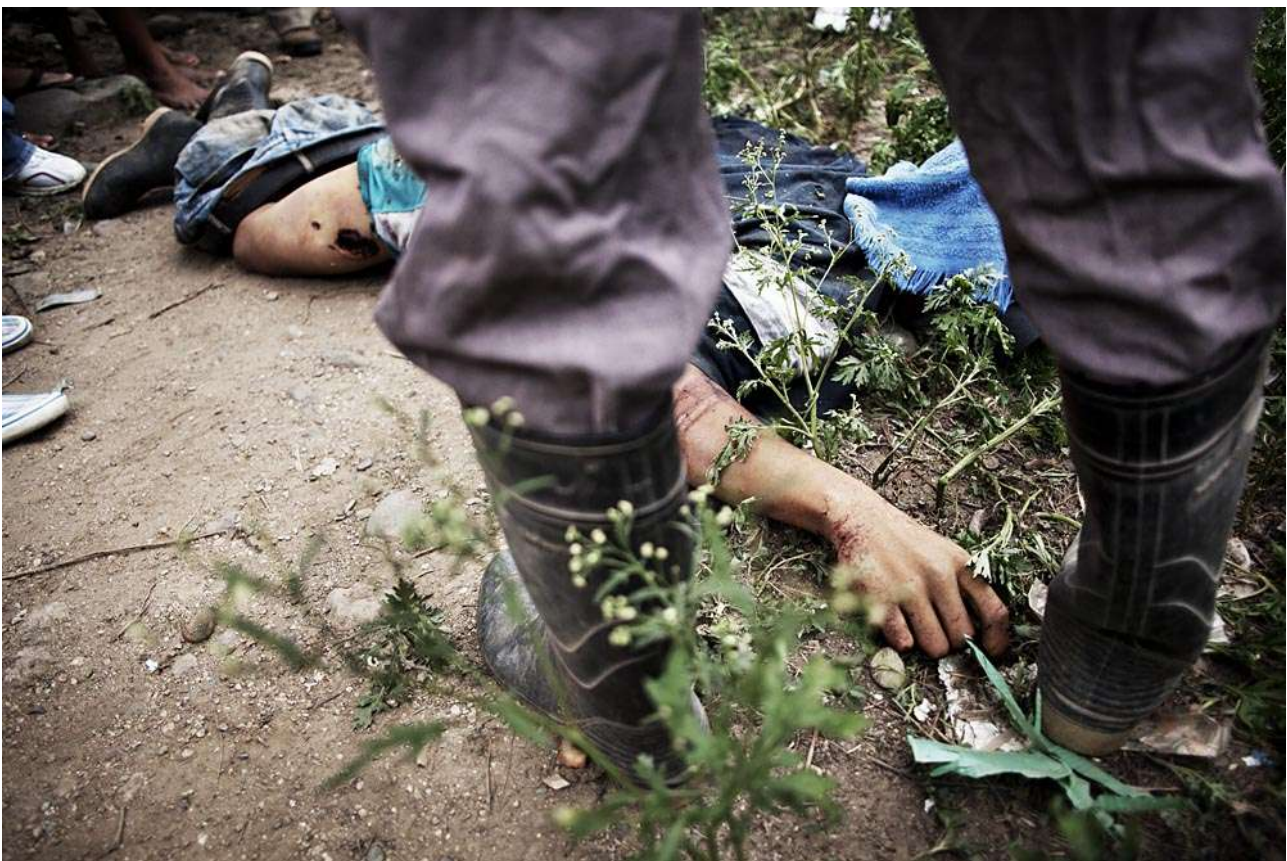
The killing of a campesino in Bajo Aguán, Honduras.

Rural people don't simply make a living off the land, after all. Their land and territories are the backbone of their identities, their cultural landscape and their source of well-being. Yet land is being taken away from them and