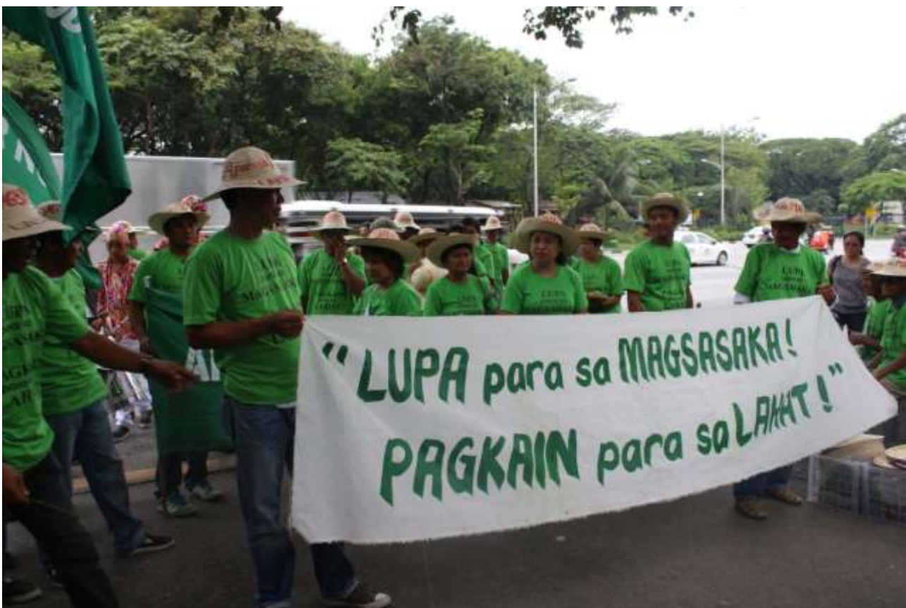
"Land for the Farmers! Food for Everyone!"

Doing nothing to turn this situation around will be disastrous for all of us. Small farmers -- the vast majority of farmers, who tend to be the most productive and who produce most of the world's food -- are losing the very basis of their livelihoods and existence: their land. If we do nothing, the world will lose its capacity to feed itself. The message, then, is clear. We urgently need to launch, on a scale never seen before, genuine agrarian reform programmes that get land back in the hands of small and peasant farmers.