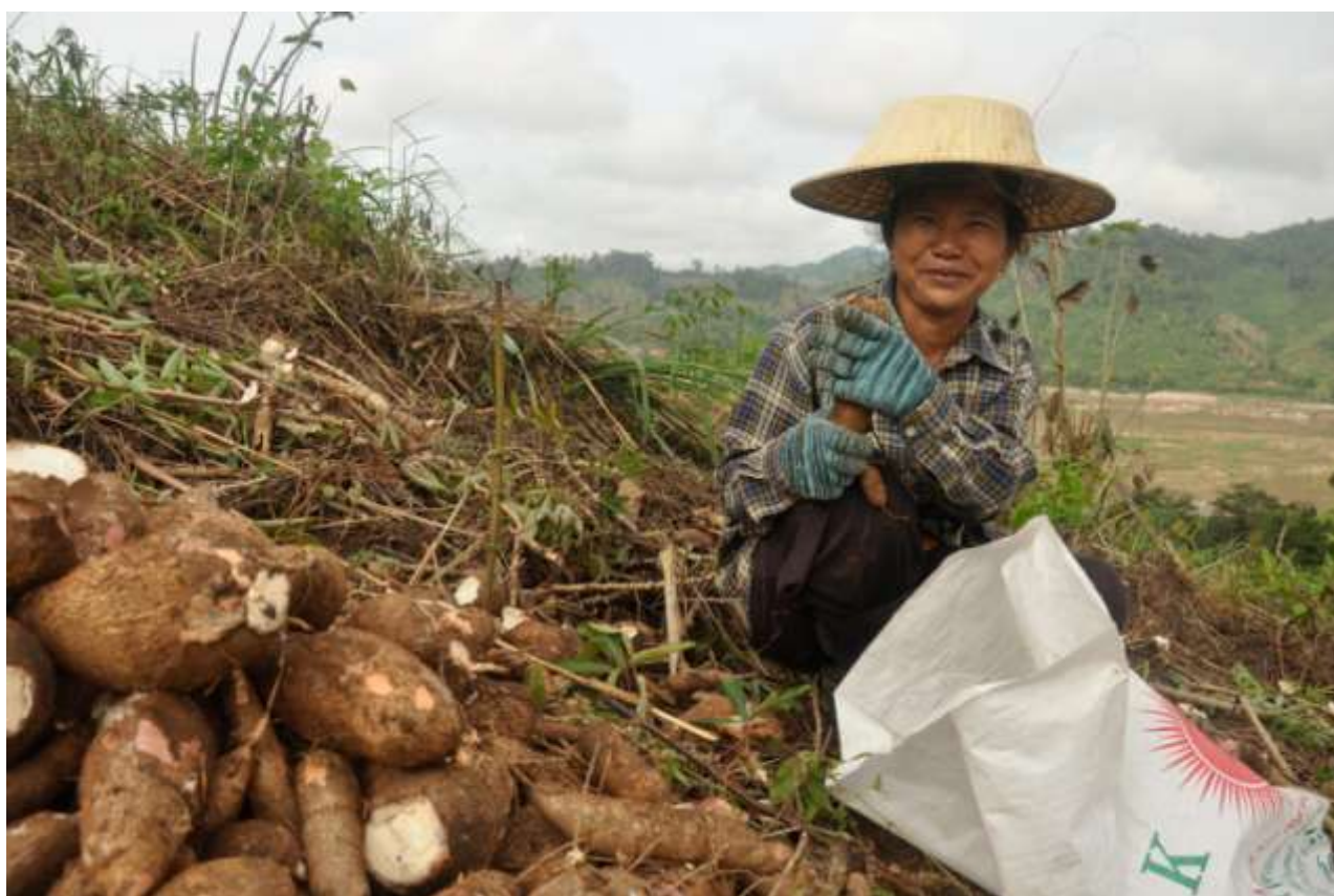
Growing cassava on the banks of the Mekong. Small farms tend to prioritise food production over commodity or export crop production.

Statistics about the role of women in Asia and Africa are difficult to obtain. According to FAOSTAT, only 30% of the rural population in Africa is economically active in agriculture and 40% in Asia -- around 45% being women and 55% men. 63 Yet studies carried out or cited by FAO show totally different numbers, indicating that in non-industrialised countries 60 to 80% of the food is produced by women. 64 In Ghana and Madagascar, women make up about 15% of farm holders, but provide 52% of the family labour force and constitute around 48% of paid workers. 65 In Cambodia, just 20% of agricultural land holders are women, but they provide 47% of the paid agricultural force and almost 70% of the labour force on family farms. 66 In the Republic of the Congo, women