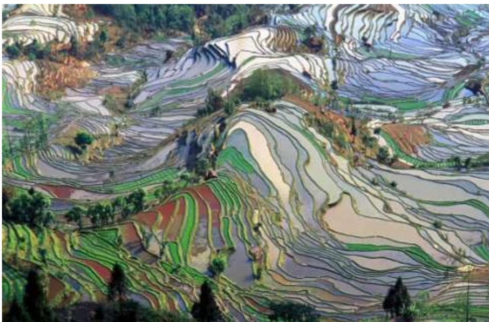
Rice terraces in Yuanyang County, China

Farmers, and more so small farmers, carry out a wide range of agricultural activities under quite diverse arrangements. These include