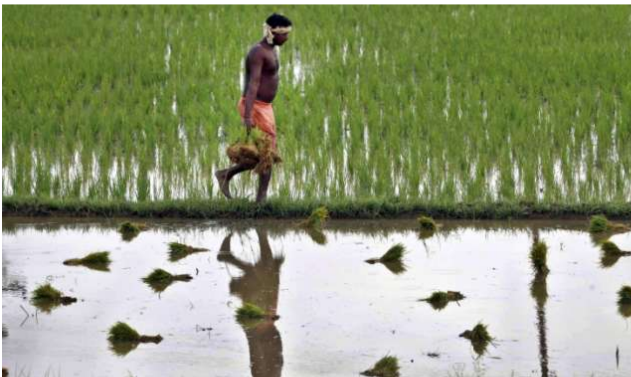
Flooded paddy in Orissa: the average farm size in India roughly halved from 1971 to 2006, doubling the number of farms measuring less than two hectares

Although big farms generally consume more resources, control the best lands, receive most of the irrigation water and infrastructure, get most of the financial credit and technical assistance, and are the ones for whom most modern inputs are designed, they have lower technical efficiency and therefore lower overall productivity. Much of this has to do with low levels of employment used on big farms in