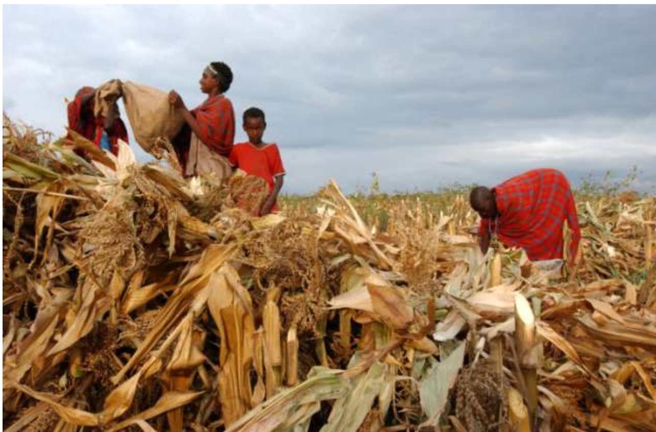
Harvesting maize in Narok, Kenya: if all the country's farms matched the current productivity of the country's small farms, Kenya's agricultural production would double.

"A kind of reverse agrarian reform is taking place in many countries."