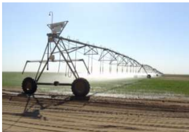
Centre-pivot irrigation, Algeria

And finally, also missing in our calculations is the recent wave of land grabbing that is now handing millions of hectares of fertile farmland to large corporations and depriving tens of thousands of farming communities of their livelihoods. Today's massive land grab took off only in the last decade and has yet to be captured in the official statistics.