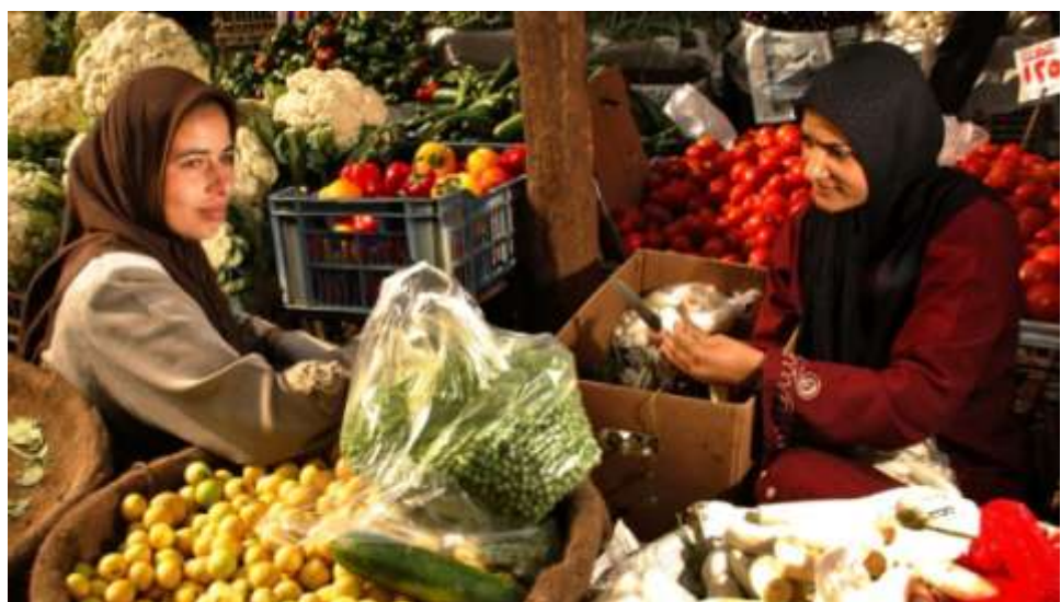
Farmers market in Turkey: the role of women in feeding the world is not adequately captured by official data and statistical tools.

If this land concentration process continues, then no matter how hard-working, efficient and productive they are, small farmers will not be able to carry on. The concentration of fertile agricultural land in fewer and fewer hands is